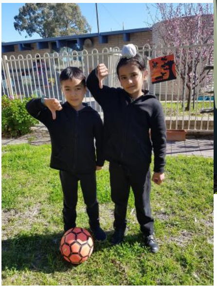
Perhaps the grass could use some extra love!